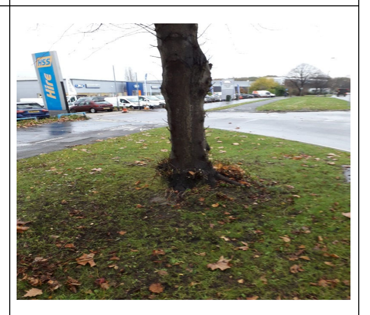
Tree Pruning Manor Royal Road