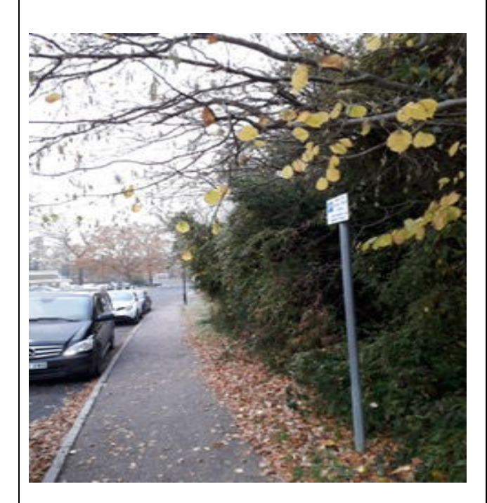
Hedge Cut Maxwell Way